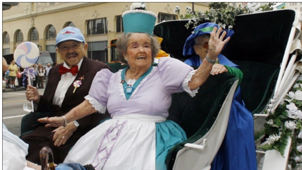
CARRIAGE AWAY: The seven remaining Munchkins arrive in a white carriage drawn by the horse of a different color you’ve heard tell about. In this case it was purple and was proceeded by the Hollywood High School Marching Band playing. “We’re Off to See the Wizard, the Wonderful Wizard of Oz.”

After the star ceremony and interviews with the worldwide press, the horse-drawn carriage returned and took the seven little actors up the street