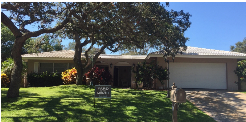
June Yard of the Month on Tanglewood Dr

Belated congratulations to all the Bay Hills grads and best wishes to all the Bay Hills dads. Hope your celebrations were joyful!