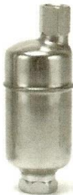
Armstrong Drain and Vent Valves