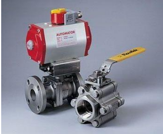
Ball Valves from Flow-Tek, Keystone and more

Process Solutions provides the finest fluid control products and check valves. Here are a few examples. Contact us for special items you need!