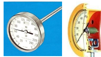
Temp and Pressure Instruments from PermaCal, Weksler, ReoTemp and others