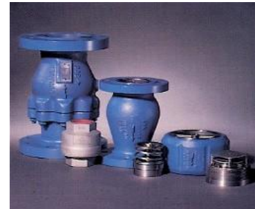
Durabla (DFT) Check Valves