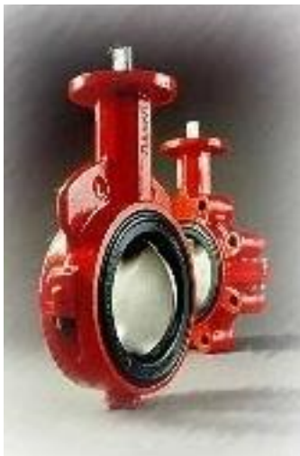
Butterfly Valves from Vanessa, Keystone and more