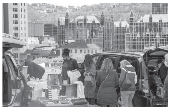
Shopping at the Car Bazaar: Parking Garage Flea Market.

In whatever way you decide to enjoy April, I hope it's filled with the qualities of a flower. Colorful days, growth, beauty, and sweet smelling moments!