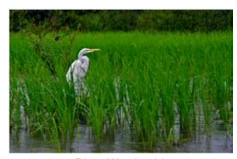
River Watch - 26 Sheldon Lloyd