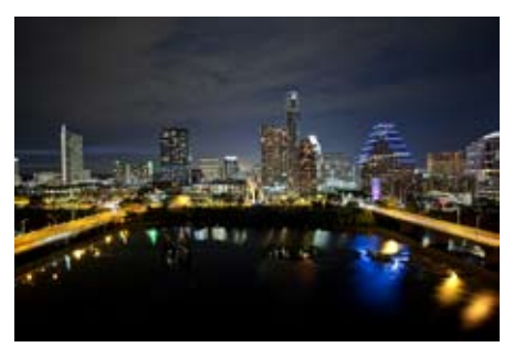
Austin Skyline - 26 Leslie Ege