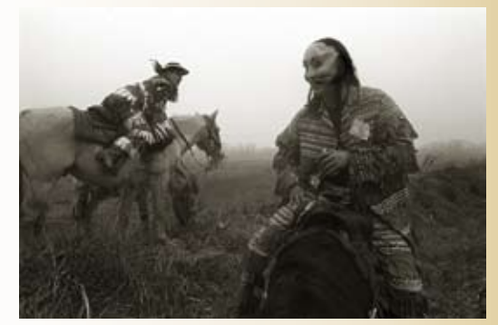
Cajun Mardi Gras, Lafayette, Louisiana 1998