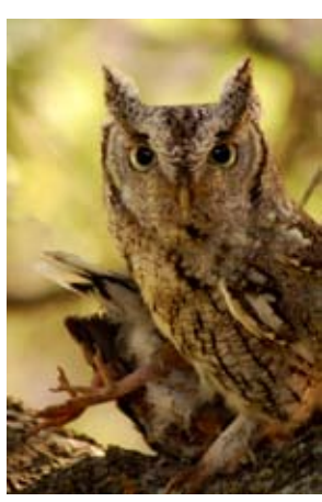
Catching Breakfast - 27 Bob Nix