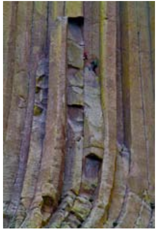
Devil's Tower Climbers - 27 Lois Schubert