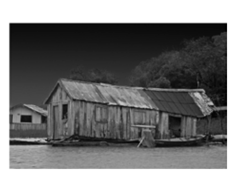
River Home - 27 Sheldon Lloyd