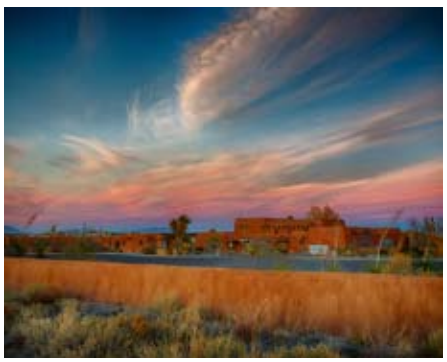
White Sands Sunrise - 27 Linda Sheppard