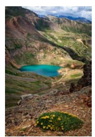
Lake Como - 27 Rose Epps