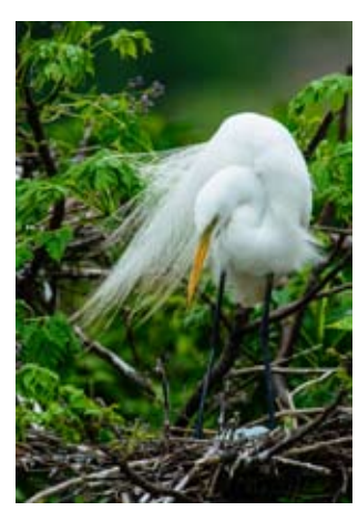
Great Egret on Nest - 26 Dolph McCranie