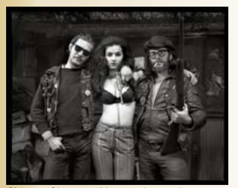
Chicago Choppers Motorcycle members.