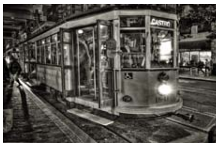
The Last Train to Castro - 27 Pete Holland