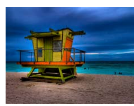
Just Before the Storm - 27 Pete Holland