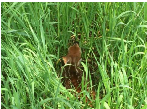
A springtime fawn bedded down.

On June 17, 2017, TEACH OUTDOORS was invited to host a fishing derby and duck calling seminar at Woodsmoke Ranch to help teach the skills of fishing to kids and adults who would like to fish but have never been fishing before. It's a great site because the kids catch lots of fish and have buckets of fun. More photos on p. 3.