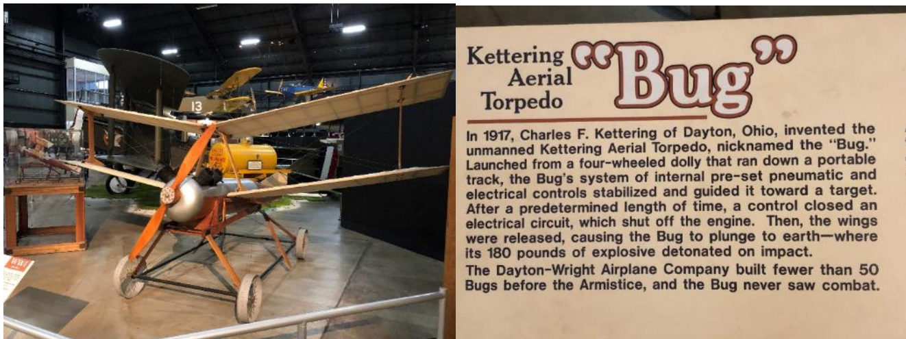
The Very First Successful Unmanned Aircraft On Exhibit at the Air Force Museum – Dayton, Ohio