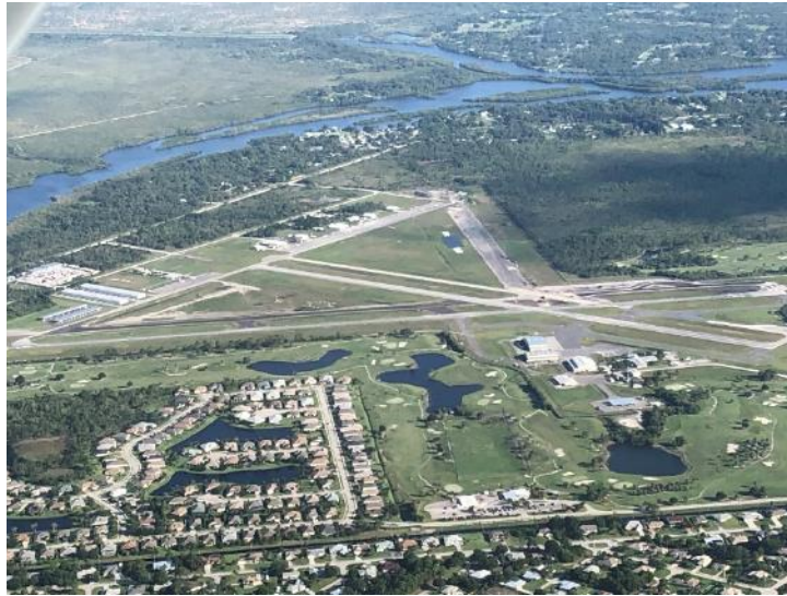
A Picture of My Home Airport X26 – Sebastian Municipal