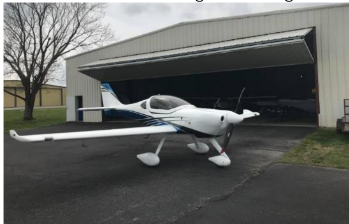
Home from Sun 'n Fun