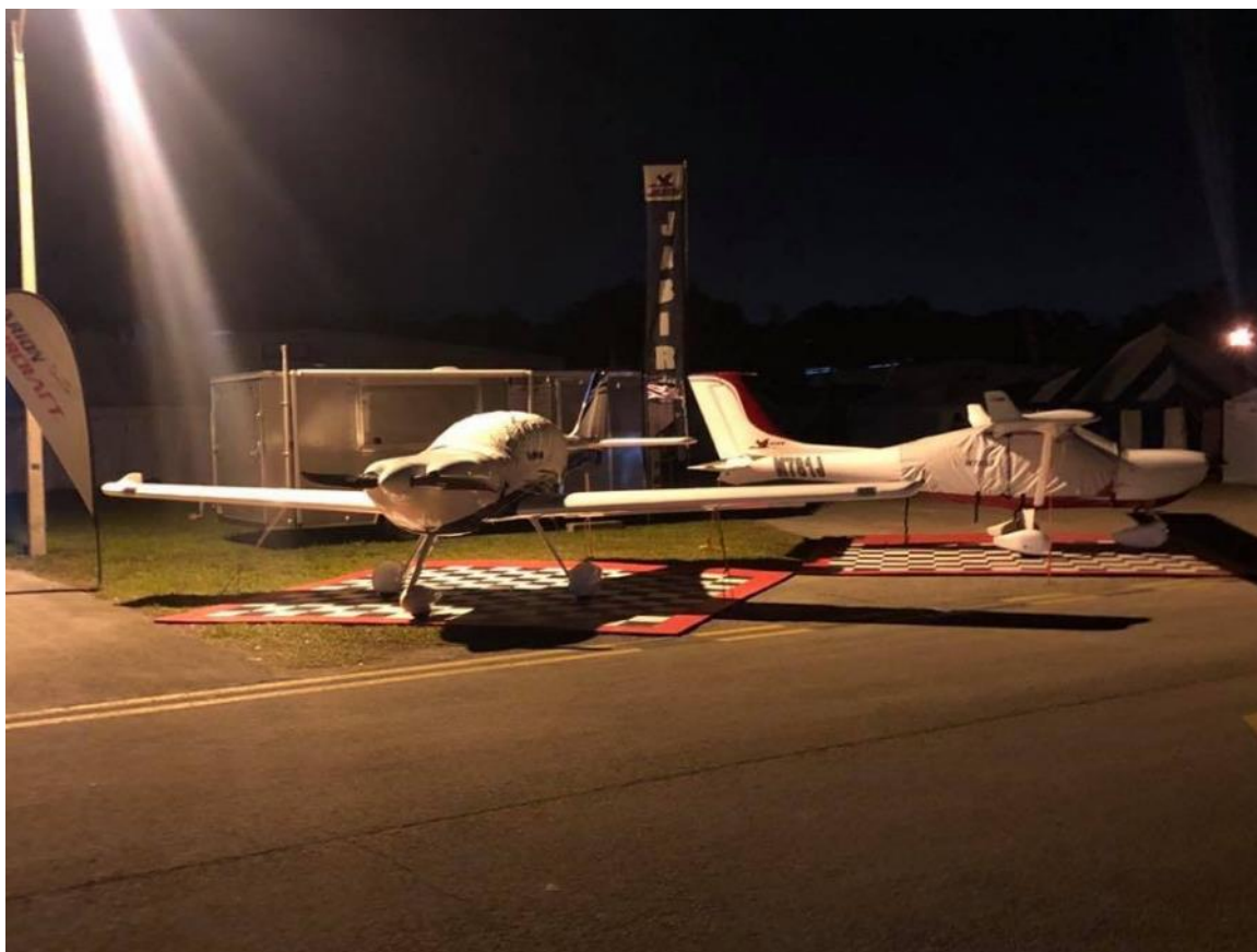
The Sun 'n Fun Booth at Night

Russia and CIS, AVIA-NIANIA Ltd , Moscow, Russia, Phone: + 7495518-62-75, Mobile Phone: + 7925518-62-75, avianiania@mail.ru or avianiania@aol.com