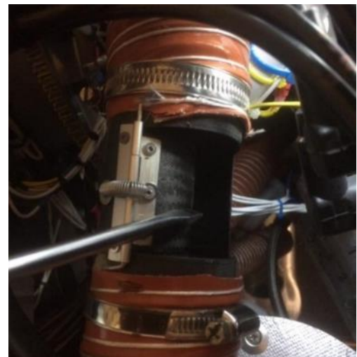
The Spring Loaded Alternate Air

Half way through the building process, I got the opportunity to move into a proper mechanical workshop, with all the most modern equipment one could dream of. This made it possible for me to construct a new throttle handle and brake unit between the two seats and other mechanical parts. The air inlet to the air filter and engine was modified according to Nick with the large NACA scoop that came with the parts from Arion. If this really increases the air pressure (poor man's compressor), has not been verified by me. Somebody asked the question: what happens if the air filter freezes over? Good question considering that this is Norway. Solution: a self-constructed carbon fiber tube, which is integrated in the air inlet hose under the cowling. The tube has a spring-loaded door, which opens under negative pressure and draws air from the heated engine