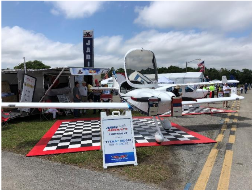
The New XS in the Booth

So, Sun 'n Fun 2019 is history. It seemed to be a pretty good show. There was a lot of interest in the Titan XIO-340. Of course there were even more questions about performance, but the plane had only been flying a short time, the ground adjustable prop is set on climb, and the engine is still being broken in. We can speculate based on earlier Lightning XS that have the same engine, but each is different. I think the final cruise at 75% will easily make 170 knots true. We can only wait and see. With the optimal propeller (maybe a constant speed), we will see a really fast Lightning XS.