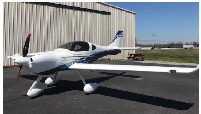
Ready for Sun 'n Fun