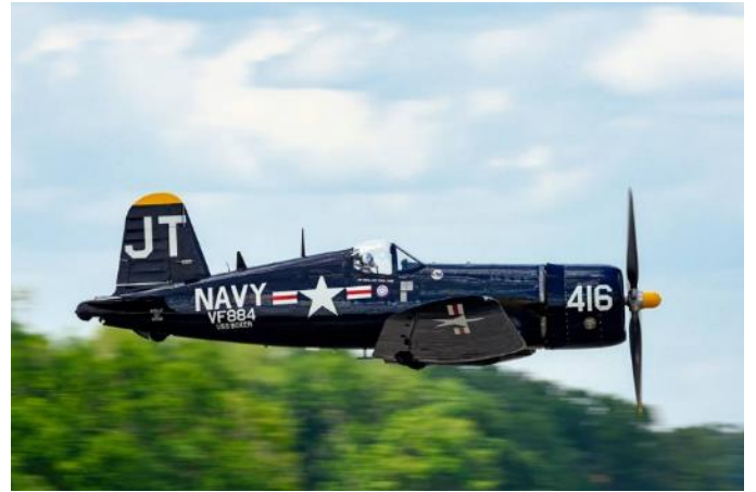
How About a Corsair?