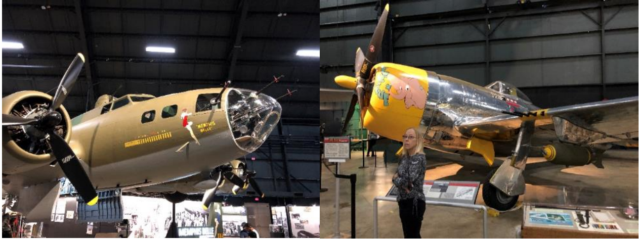
On the Left the Memphis Bell and on the Right a P-47 Thunderbolt

Unfortunately, I have not been able to get any news from Lightning Aircraft West. I am sure they are busy and have not been able to get back with me. So, below there are some pictures of the Air Force Museum.