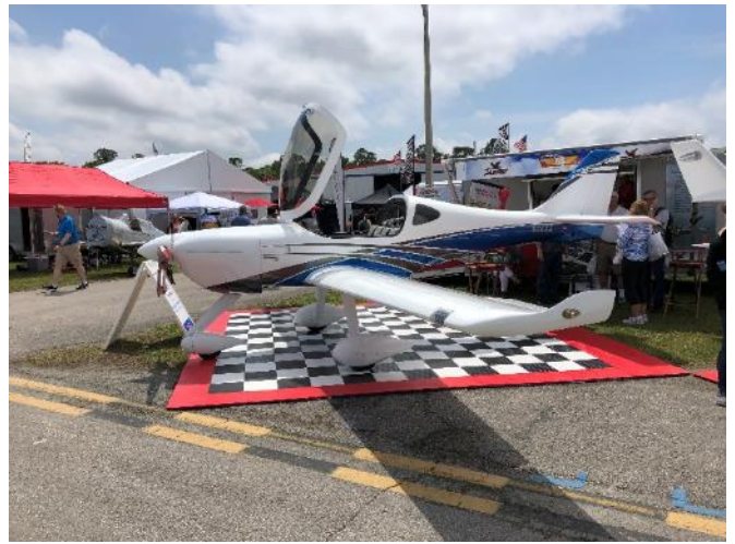
The XS 340 in the Booth