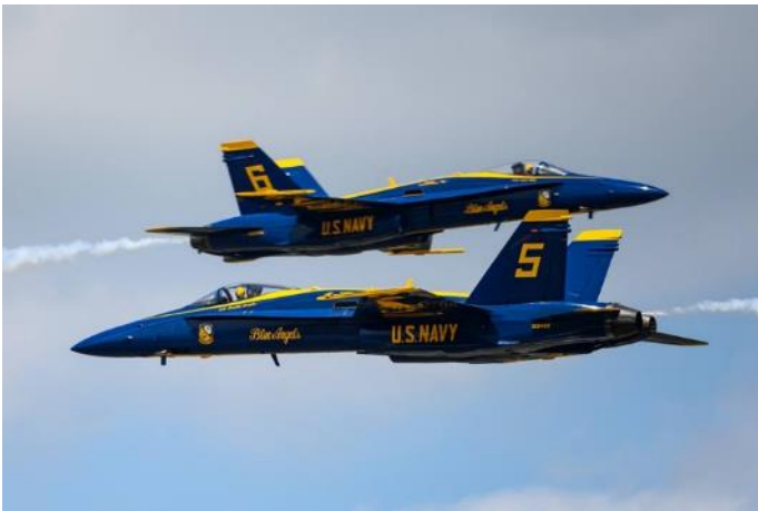
The Blue Angels