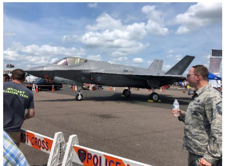
The F-35 Lightning II