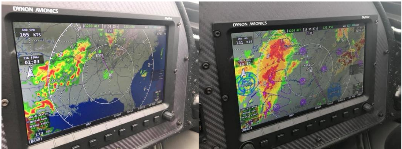
On the Left, Weather Ahead - On the Right, Racing the Weather into SYI

Below are some picture of the XS going back to Shelbyville after Sun 'n Fun. It seems like Nick is always chasing the weather or trying to out fly it. Not sure which.