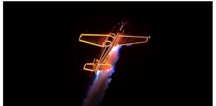
The Night Air Show