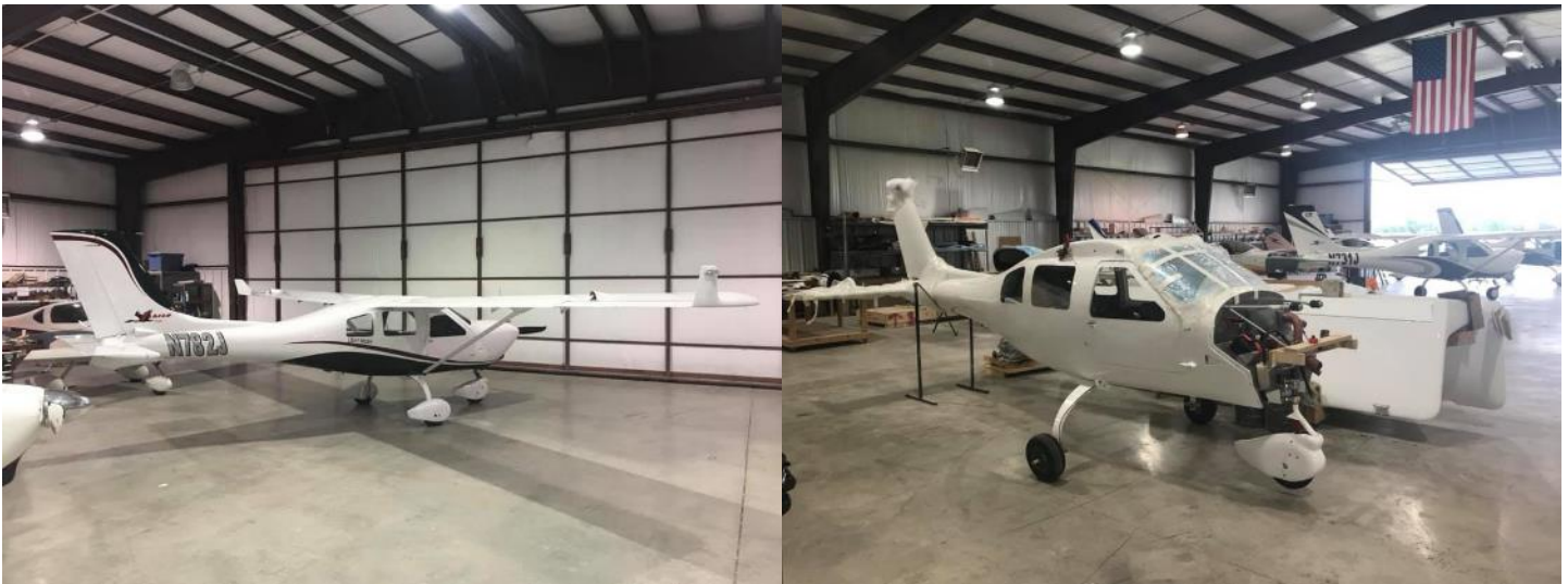
Two New Jabirus, One Completed, One Ready for Assembly

The factory is pretty busy and it always isn't just the Lightning builds. Arion also puts the new Jabiru Light Sports together for delivery to the dealer or customer. Below are pictures of one ready for delivery and one just in for assembly.