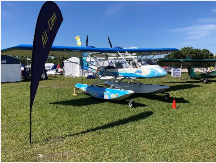
A Really Cool Paintjob on an AirCam