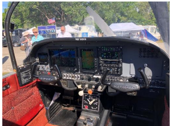
A Garmin Cockpit in a Grumman Tiger