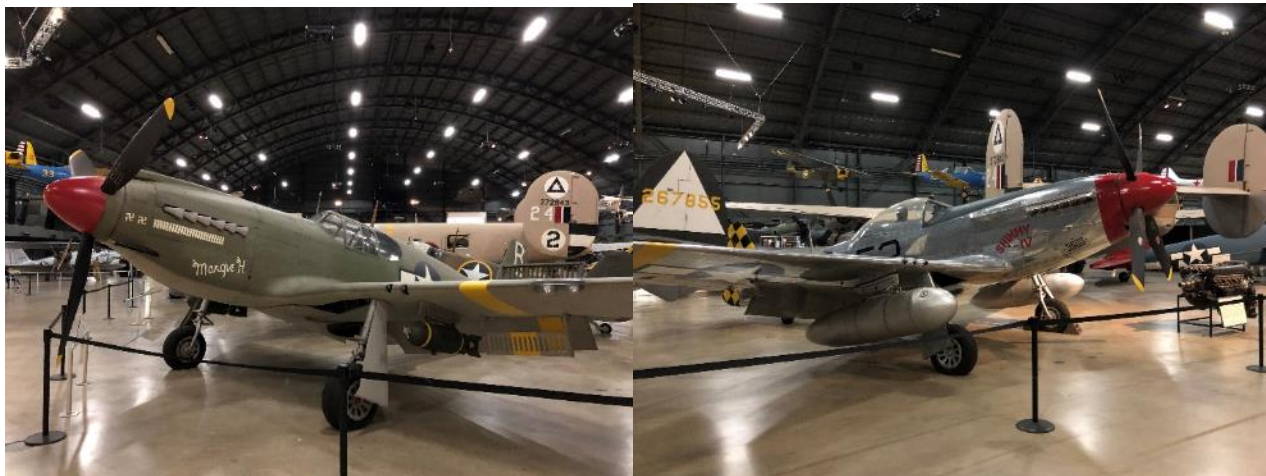
Two Versions of the P-51 - The A and D Models