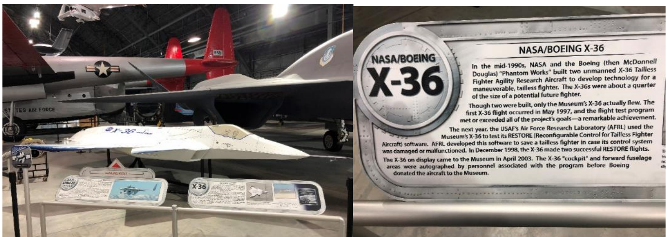
Can You Believe First Flight 1997?- Air Force Museum Exhibit

Sensenich W60ZK53G wood composite for Jabiru 3300, $500