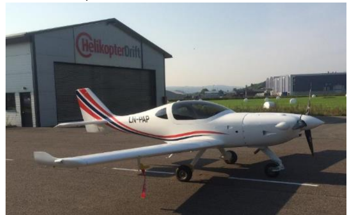
Before Wheel Pants

After everything was approved by my controller, the local EAA and then the Norwegian Civil Aviation Authorities, it was time for some test-flying. An immediate problem was a result of the original pitot-tube/static from Arion being replaced with a Dynon heated pitot / angle of attack indicator that did not have a static port on it. To find a neutral location for the static was not an easy matter. First I tried a location on the sides of the hull approximately 20 cm behind the firewall. Each time I would take it for a flight and compare indicated speed to the GPS values. The best positions for the static ports I found to be on each side of the hull, halfway between the cabin and the tail, in an area that is relatively flat. The indicated air speed is still approximately four knots above true speed, but that is as good as I could get it with a separate position for the static port.