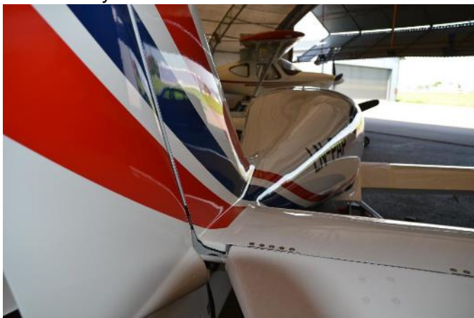
The Colors of the Norwegian Flag

After painting the aircraft, it was time to move everything to a large hangar at the military airport Kjeller. It is discussed if this airport is the oldest or second oldest airport in the world, which has been continuously active since its start in 1912.