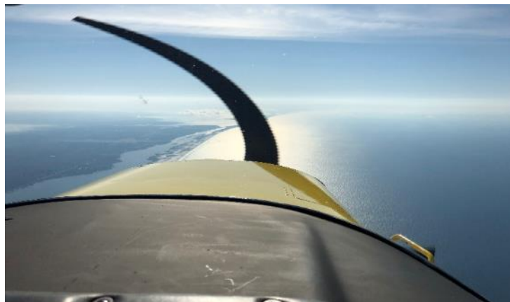
On the Way Back from Pensacola – Early Morning