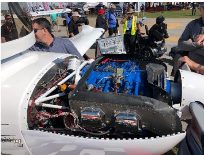
The XIO-340 Opened Up to See