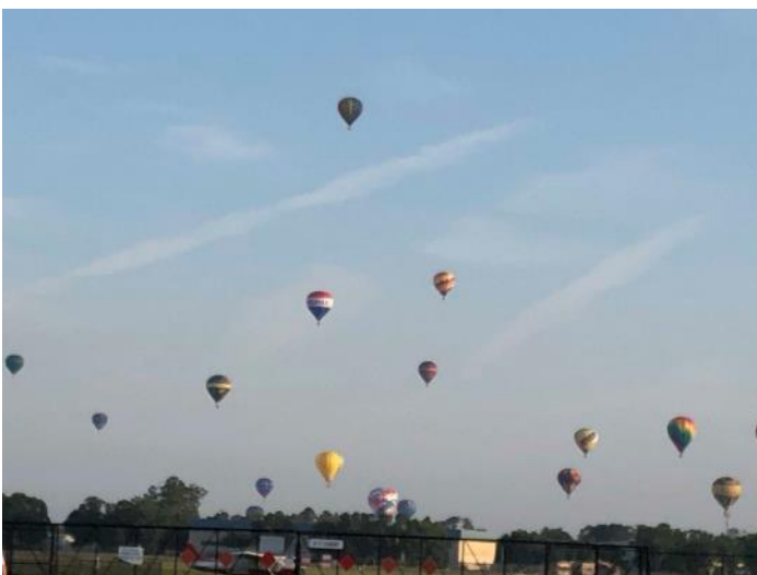
How About a Balloon Launch?