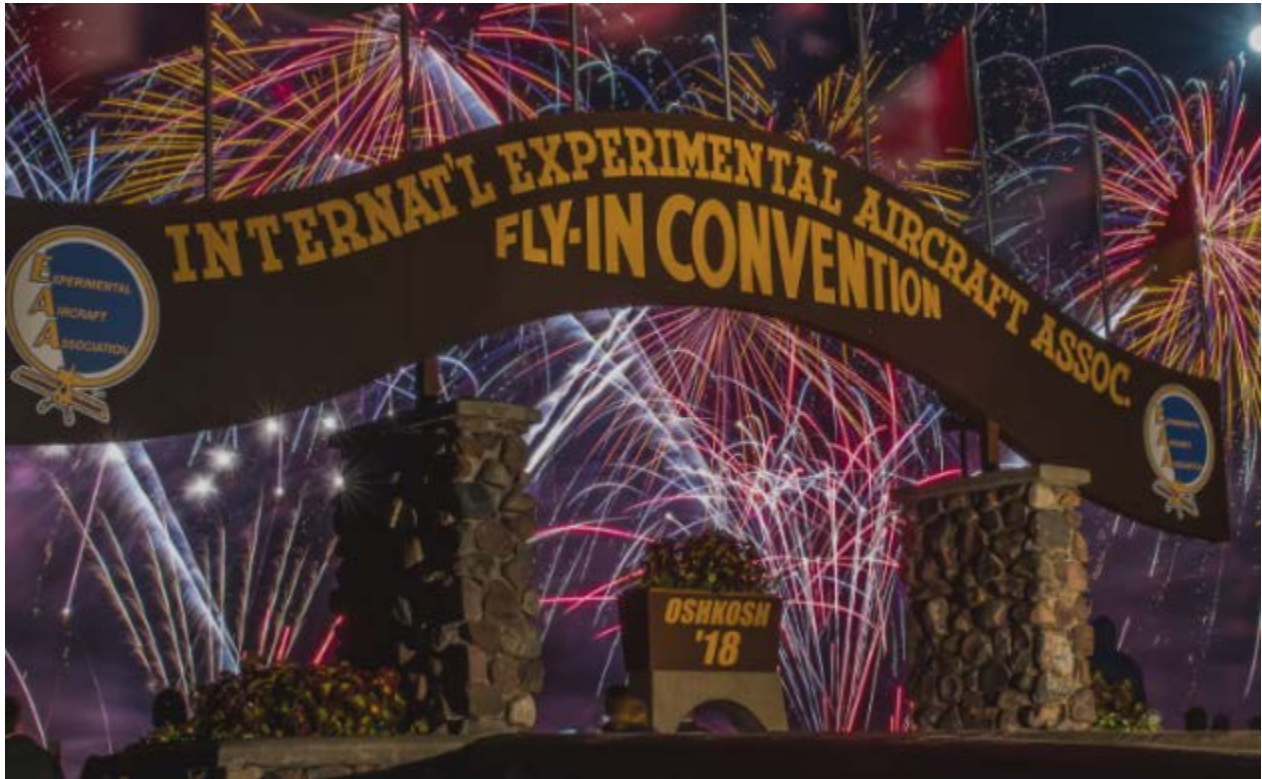
EAA AirVenture 2019