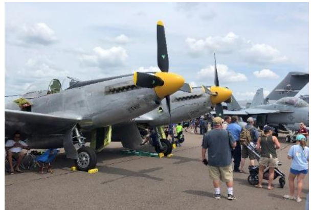
The P-82 Above and Below