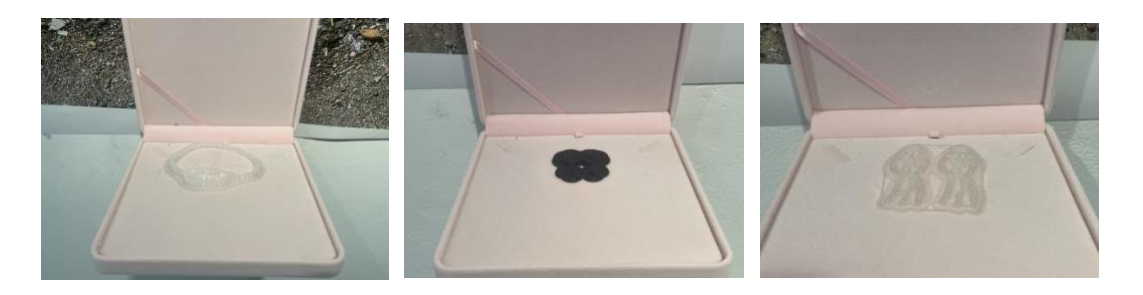
untitled HD Video, 9'47"