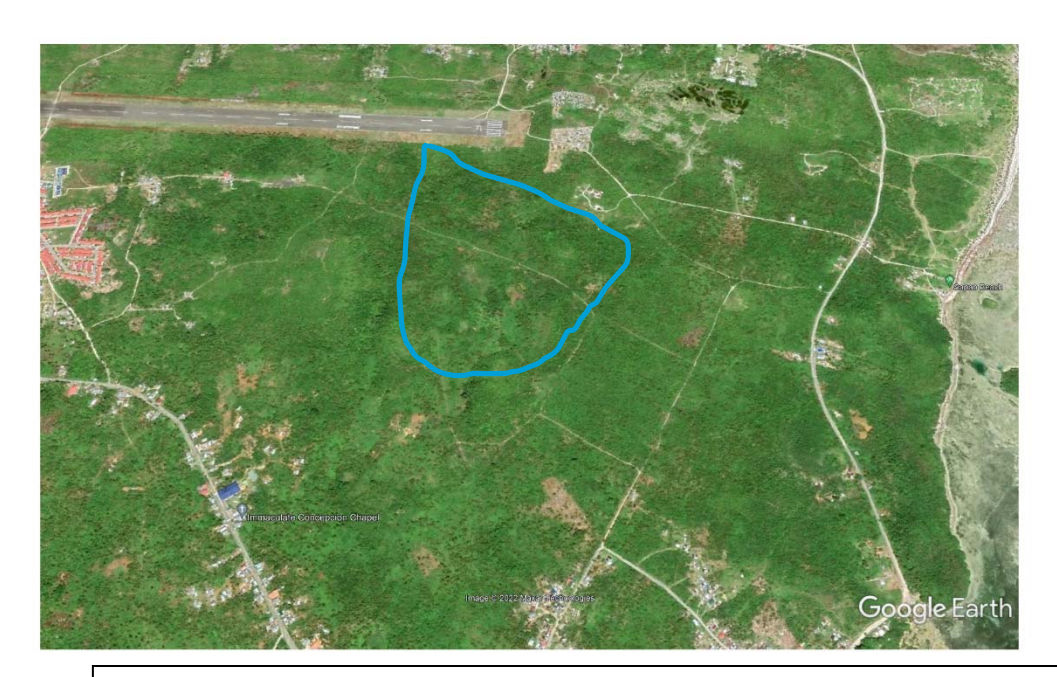
Figure B1: Approximate location of proposed Ichicoo Park. Basically, two hills and a hole. Recent Google Earth shot.

I hesitate to nominate any one area because Guiuan like most of the Philippines is full of natural beauty. Guiuan is special because nature has been unleashed by the typhoon and the associated natural processes that humans will have to work hard to diminish. At the same time the natural assets, if left to their ecological processes of progression will serve to protect the community from future disturbance. This area is basically two hills and a hole. Ichicoo Park is the designation I have chosen. Not for any reason, other than I like the song. There is a link to the song as a YouTube offering. Anyway, it is located directly in the middle of the gap between the two ridges and protects the air strip and one of the new resilient housing projects in Tagpuro.