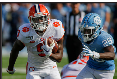
Former No. 1 Clemson nearly lost outright to unranked North Carolina this past Saturday. The Tigers were near 4-TD favorites and were -3000 on the money line. Clemson stopped a late 2-point conversion that would've given North Carolina a 22-21 lead with under 90 seconds left.