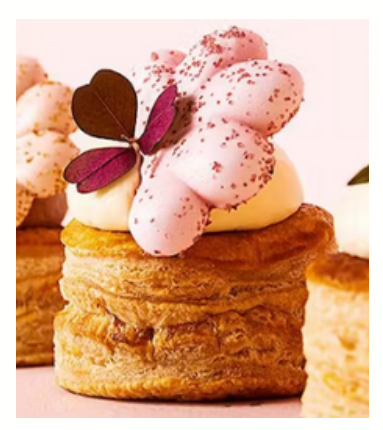
Modern flaky pastry buns

Also search 'Fastelavnsboller' on TikTok to see Danes ranking the best in their town. Traditionally these treats were bread type buns filled with marcipan "remonce" and/or custard. But the modern versions are artistic, elaborate cream filled flaky pastries made with "weiner" dough. They sell for $10-$15 each and are "To die for!". Ja tak! Lisa Olsen