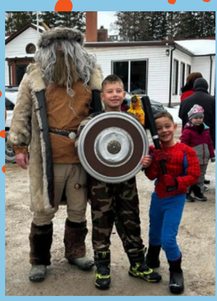
THANK YOU TO THE VOLUNTEERS THAT PUT THIS EVENT TOGETHER!