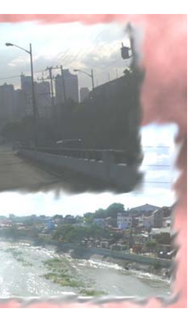
an areas and polluted waterways.

As nature struggles to regain its equilibrium, mankind is now facing a new threat: global warming. As the earth's temperature rises, it brings