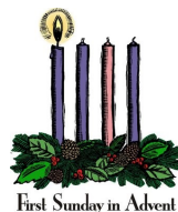
First Sunday in Advent