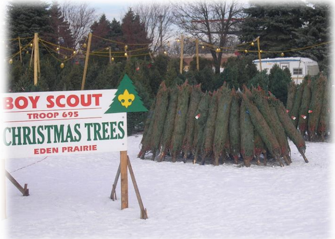
Tree Lot Was Set Up