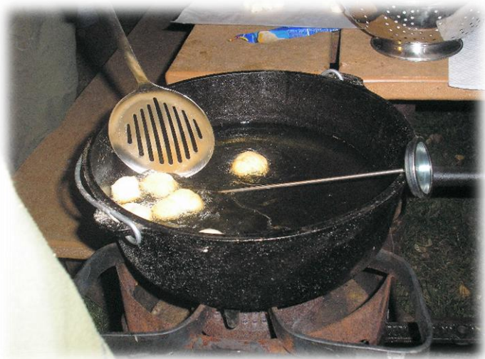
Cooking during Campout