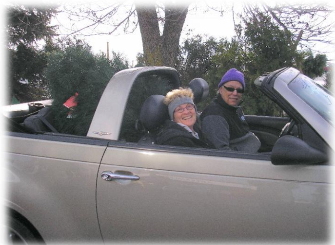
Happy Tree Lot Customers