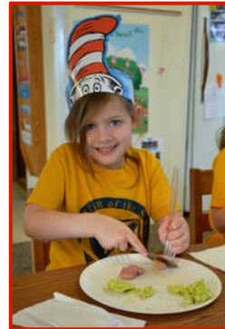
Pre-K made Green Eggs & Ham, and read Seuss books with their 8 th grade buddies.