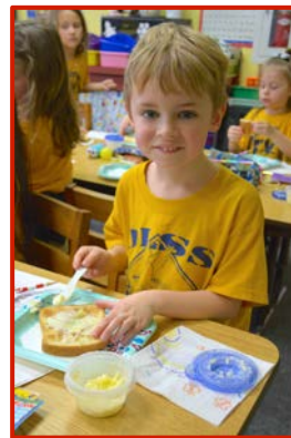
Kindergarten read The Butter Battle Book & made their own butter.