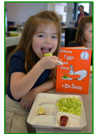
Our Hot Lunch Program served Green Eggs & Ham for lunch.