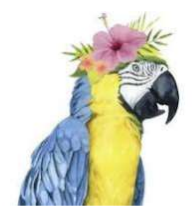
Written by Pam Beard