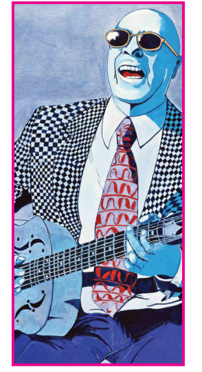
Original art by Artist Samuel Pace, Los Angeles, CA

Outstanding wines make great food even better. Take a bite from some of the region's best restaurants, and sample a variety of tasty cuisine. There should be something to satisfy every appetite... pasta dishes, soups, salads, salmon,