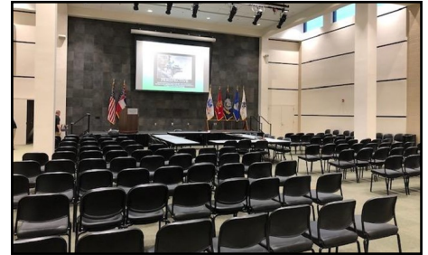
Grand Gallery Armed Forces Museum

Transportation for the Friday tour will be provided by vans. We will have approximately 15 attendees per van with a base historian as a guide for each group. Lunch will be served at the Base Dining Facility. We thought about handing out MREs and stopping to picnic but thought better of it!