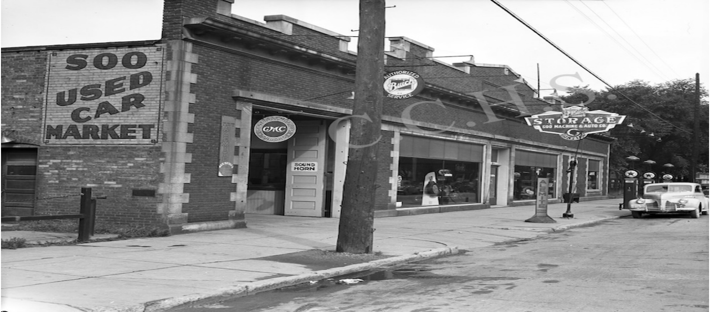
Soo Machine & Auto Co. ca. 1940 with a 1940 Pontiac Deluxe Six (or Eight) parked outside.

-All of these buildings still stand today.