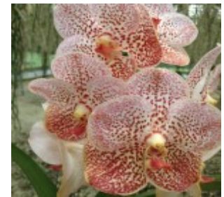
Ascda. Suksamaran Spot x Ascda. Tubtim Velvet from Goodwin Orchids

January 9, 2018 7:00 p.m. Employee Wellness Center 201 East Dixie Ave. Leesburg, Florida