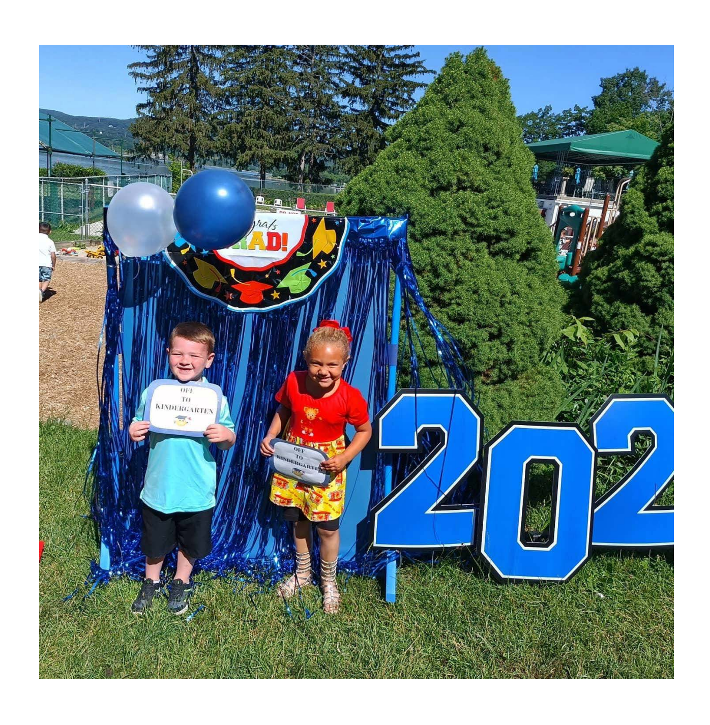
Good Luck Next Year in Kindergarten to all of our graduates! We will miss you!!!!