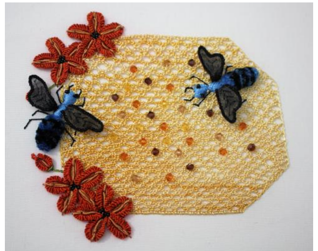
Blue Bumble Bees MP-2 Debbie Goff