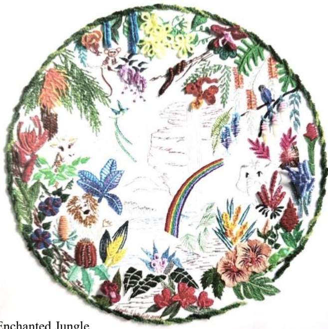
Enchanted Jungle 2 Sessions: SuA-2 and SuP-2 Mendie Cannon