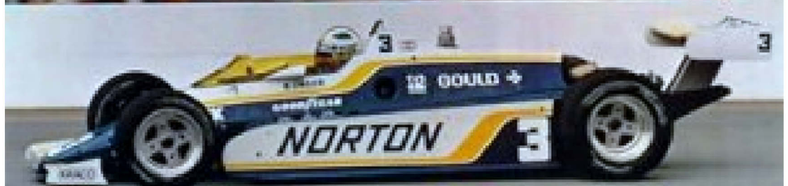
Bobby Unser, Three-Time Indianapolis 500 Winner