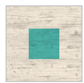
S - Sierra NF-019