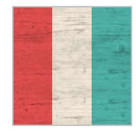
T - Tango NF-020