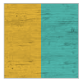
K - Kilo NF-011