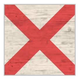
V - Victor NF-022