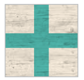
X - Xray NF-024