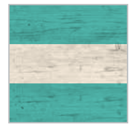
J - Juliet NF-010