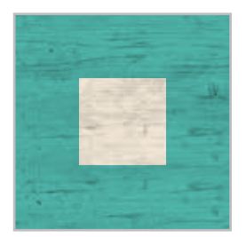
P - Papa NF-016