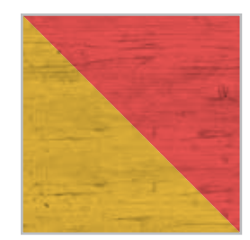
O - Oscar NF-015