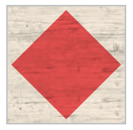
F - Foxtrot NF-006