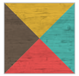
Z - Zulu NF-026