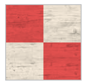
U - Uniform NF-021