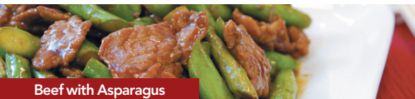
Beef with Asparagus