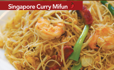
Singapore Curry Mifun 🌶️