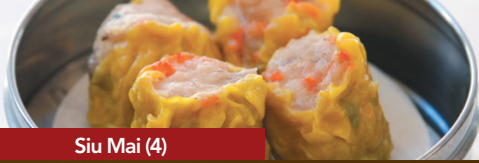
Siu Mai (4)