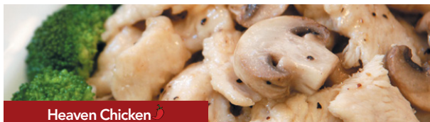
Heaven Chicken 🌶️