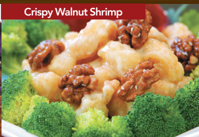
Crispy Walnut Shrimp