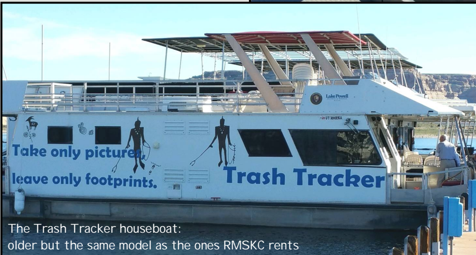
The Trash Tracker houseboat: older but the same model as the ones RMSKC rents

If you're interested, there are trips from both Wahweap and Bullfrog. Opportunities for this season are full, but applications for next year will be accepted on the Trash Tracker website at 7:00AM on February 1, 2018.