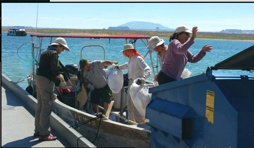
A Park Service ranger drove a dumpster down to the scow and helped us unload it

If you're interested, there are trips from both Wahweap and Bullfrog. Opportunities for this season are full, but applications for next year will be accepted on the Trash Tracker website at 7:00AM on February 1, 2018.