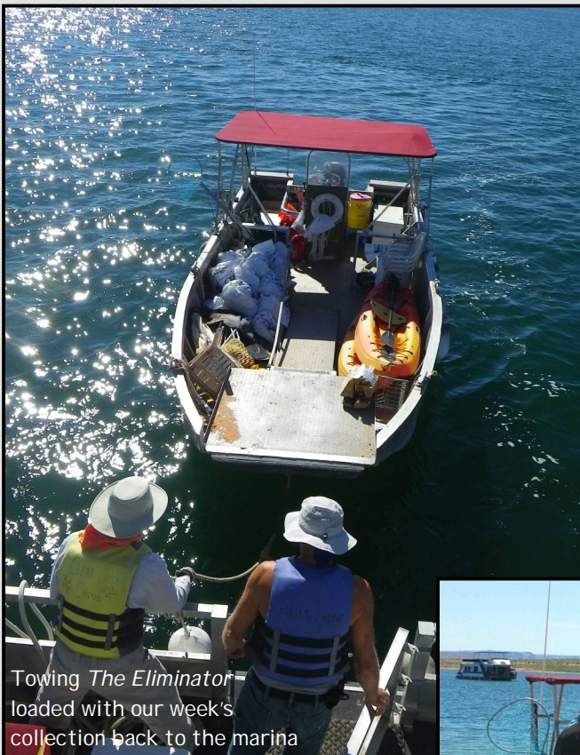
Towing The Eliminator loaded with our week's collection back to the marina

Over the five days we filled 36 large heavy-duty bags with trash. We also collected two dozen golf balls and a huge pile of discarded wood, sun shelters, floating toys, garbage can lids, etc. Only one site was truly disgusting; most of the rest of what we found seemed left behind more from carelessness than blatant disregard.