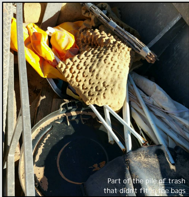
Part of the pile of trash that didn't fit in the bags