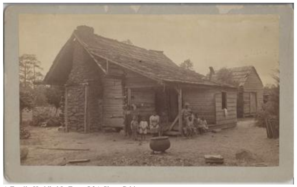
A Family Huddled In Front Of A Slave Cabin

The black population in 1840 has grown to 2.87 million people in total, with 87% still enslaved, all living in the South.