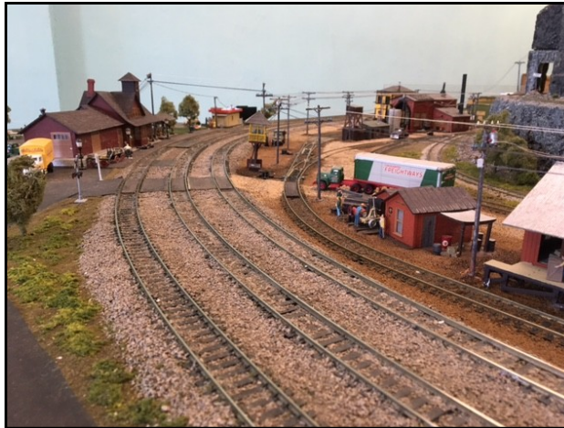
Photos of just one of our many layouts