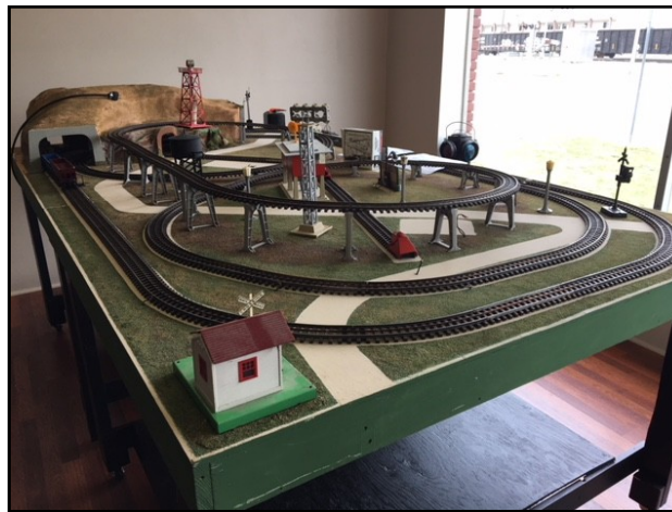
Lionel 1958 #D-224 store front layout

Contact us through our website or via US mail service.