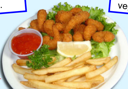
POPCORN SHRIMP Served with steamed vegetables or French fries.