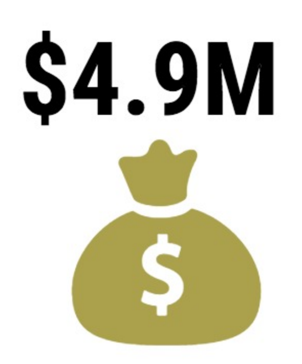
Partnership HealthPlan of California Local Housing Innovation Grant