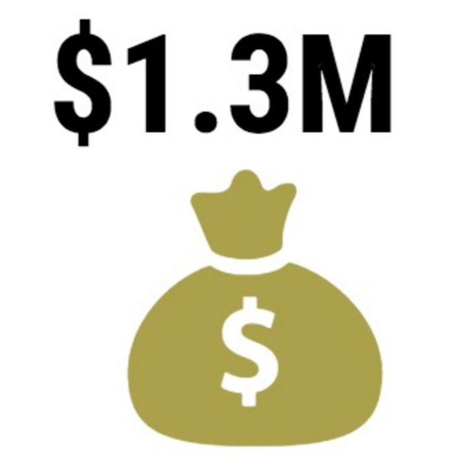
Department of Housing and Urban Development Continuum of Care Program Funds