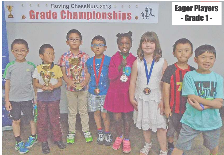
Eager Players - Grade 1 -