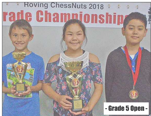
- Grade 5 Open -

could be held in various parks around the city. Let us know if you want to host one in your neighbourhood or backyard!