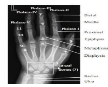
Fig.2: Left hand Radiograph with TW2 ROIs