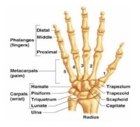
Fig.1: Left Hand Wrist Bone

in light of two qualities: The level of improvement in extents encountering solidifying, and the level of calcium hoarding in those regions. From most punctual stages, these two qualities take after a certain and specific case and course of occasions till adulthood. Examines performed from the most punctual beginning stage of the twentieth century to the present have made use of left hand and wrist radiographs for examination purposes. There are certain ideal circumstances associated with using only the left hand as opposed to both hands. In particular, using one hand diminishes both the cost of strategies and the individual's presentation to radiation significantly. The way that the left hand has lower chances of experiencing disasters and damage on account of the higher pervasiveness of righthandedness in numerous social requests, and the way that researchers playing out the basic studies on bone age examination favored using the left hand is the fundamental reasons why the left hand is used in bone age assessments.