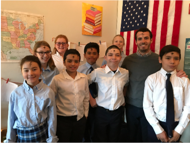
The sixth-grade class pictured with their ashes received from Mass. Ash Wednesday marks the beginning of the 40 days of Lent.