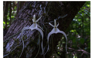
Dendrophylax lindenii Programs on Wild Orchids of Florida

Please Support Our Member Growers & Suppliers