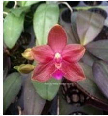
Phal. Bredren's Cutie Pie