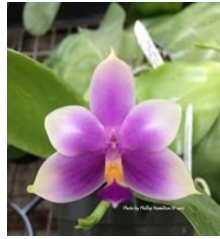
Phal. Samera var coerulea