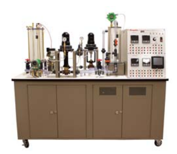
MODEL H-ICS-8189-4 Instrumentation and Control Trainer 62"H x 75"W x 30"D

The Hampden Model H-ICS-8189-4 trainer provides experience in setting up, tuning, operating, and troubleshooting actual instrument and control systems of the type used in the power and process industries. The trainer provides instruction in the measuring and transducing of such physical variables as pressure, temperature, flow and level by simulating a different process loop. Students and trainees learn instrumentation and control techniques of standard commercial manufacturers, such as