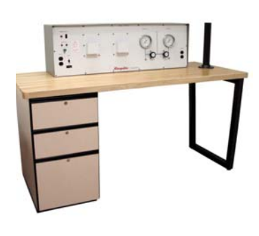
MODEL H-6485-10 Instrumentation and Calibration Console 52"H x 60"W x 34"D

and Rosemount. Various types of closed-loop control are covered: on/off, proportional, proportional plus integral, and proportional plus integral plus derivative, as well as a variety of final control devices, including electric, pneumatic and electronic.