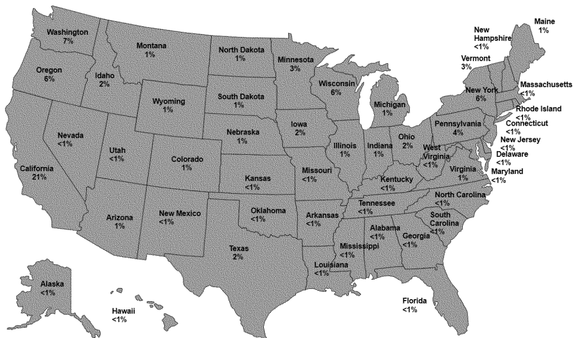
Figure 1 above shows the distribution of organic production by volume across the U.S. Of total organic production across the U.S., California accounts for 21 percent. Based on NASS 2014 Organic Survey data, California produces the majority of the volume in most agricultural commodities. In descending order, California produced the following portion of organic agricultural commodities across the U.S.: 63 percent of nuts, 57 percent of vegetables, 50 percent of poultry (excluding eggs), 27 percent of fruit, 23 percent of dairy products, 23 percent of beef cattle, and 10 percent of field crops.

After California, Washington State is the next largest producer of organic commodities in the U.S. with 7 percent of total volume. The majority of Washington's production is in fruit, with 64 percent of the total organic non-citrus fruit production volume in the U.S. Florida's citrus industry accounts for 2 percent of all organic fruit production and 16 percent of U.S. organic citrus production. Washington also accounts for 12 percent of egg production, 6 percent production of vegetables, 5 percent of beef cattle, 3 percent of dairy products, and 1 percent of field crops.