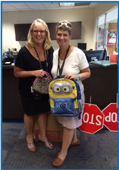
Thank you for your support!