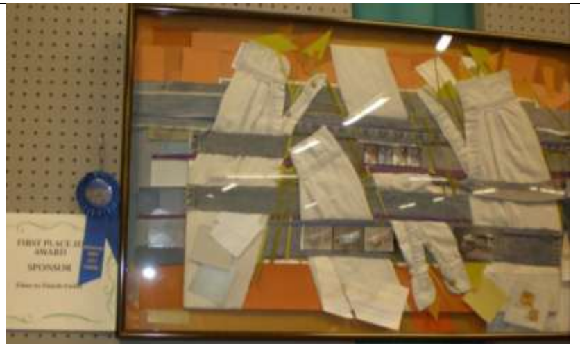
AFAF Awards sponsored by F2F – to the left: Red-Fire of the South-Recognition- FengShui Series;, above: Off the Cuff Recycled: Denim Series