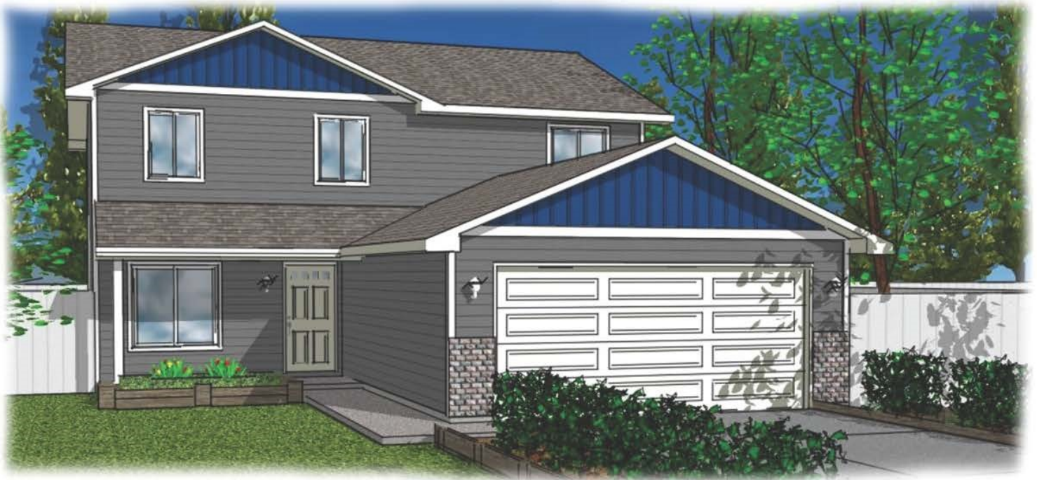
(Color combinations for brochure use only)

All measurements, dimensions and square footage are approximate and may vary. Prices may change without notice.