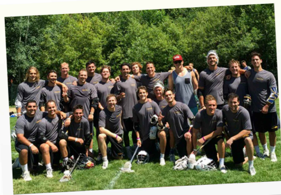
Team One Six

We would also like to again thank our friends at Cheshire Sport for their talent in creating great uniforms at cost!