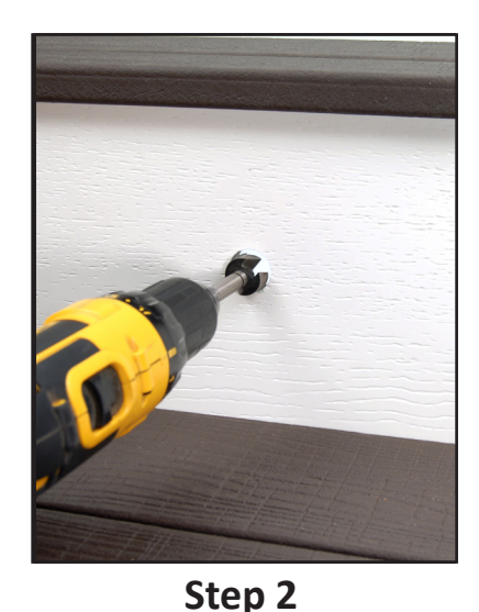
Drill 1" diameter hole through riser for recessed light using 1" forstner drill bit.

Determine location of recessed stair light and mark for drilling.