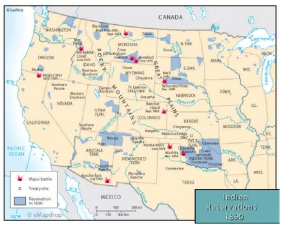
Map of final Tribal reservations in the west, circa 1890

The pillage that Jackson initiates against the tribes will continue largely unabated for the next six decades.