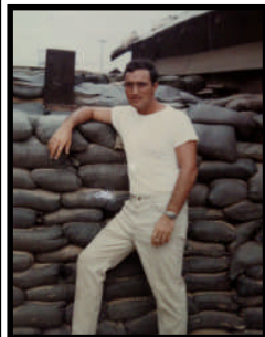
Danang 1969—Airwing uniform?

Well you know the Clint Eastwood character in Heartbreak Ridge "Gunny Highway" well we had one there and I did think I was going to die humping those damn hills, night maneuvers, POW camp training and oh run running in formation at night back to those WW1- WW2 Quonset huts.