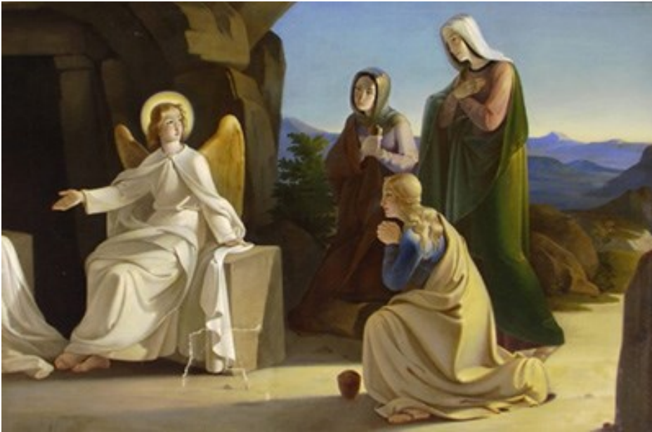
Ludwig Ferdinand Schnorr von Carolsfeld Three Marys at the Tomb of Christ, 1835