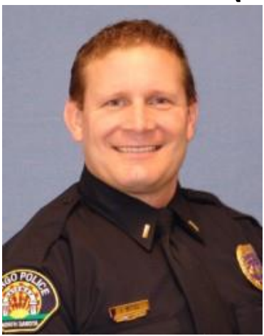
BREAKOUT SESSION: The Internet as the "Gateway to Youth Vulnerability"

Many assume that children at risk for victimization are neglected or from dysfunctional homes. However, all children, even those from supportive families, may be at risk of victimization. We need to expose the myth that North Dakota is immune to having their children exploited by those seeking to benefit from their vulnerability. Many human trafficking and juvenile luring cases start with the offender contacting the potential victims on social networking sites such as Facebook, LinkedIn, and Pinterest. The techniques used by the offenders to gain trust are as plentiful and they are disturbing. This presentation will highlight real life cases that have impacted communities across North Dakota. It will outline techniques used by offenders to target potential victims online. It will offer insight into the minds of offenders and how sexual predators groom their victims. We will discuss how as a community we can help protect our children from falling victim to these heinous crimes. The information you experience in this session will send a chill up your spine. The computer age along with North Dakota's Oil boom has brought the horrors of Sex Trafficking and trade to our region. There is an endless number of alarming trends with trafficking in your own community.