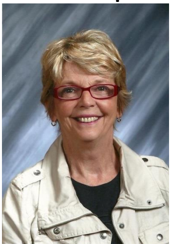
BREAKOUT SESSION: Lifestyle Plus