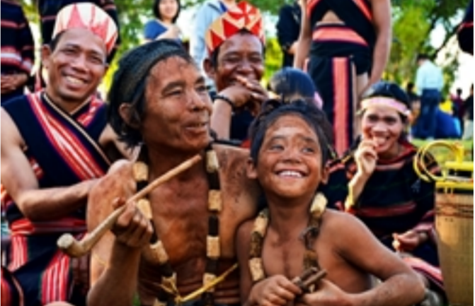
Gong festival in photos