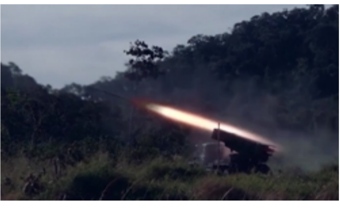
First News Program in January 2019