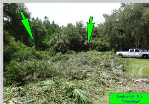
Look at all the trimmings!