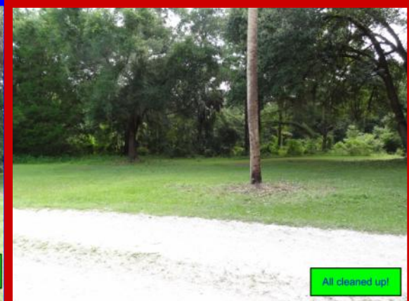
All cleaned up!