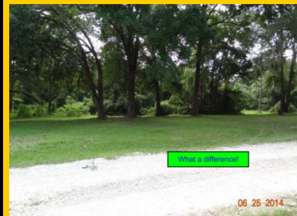
What a difference!