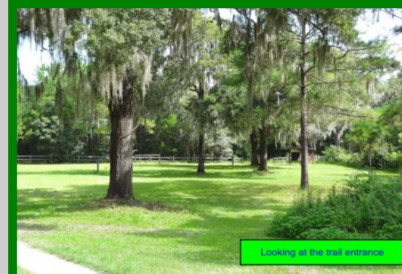
Looking at the trail entrance

★ Special thanks to this group!! They always come!