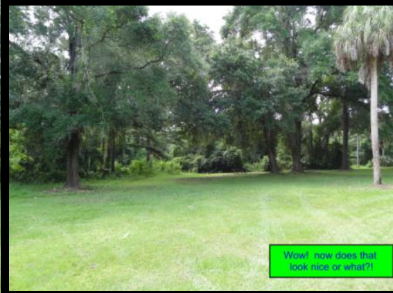
Wow! now does that look nice or what?!