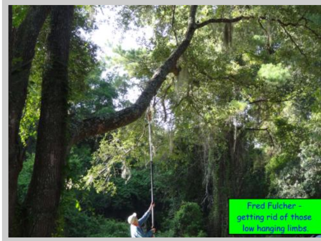
Fred Fulcher - getting rid of those low hanging limbs