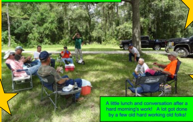
A little lunch and conversation after a hard morning's work! A lot got done by a few old hard working old folks!