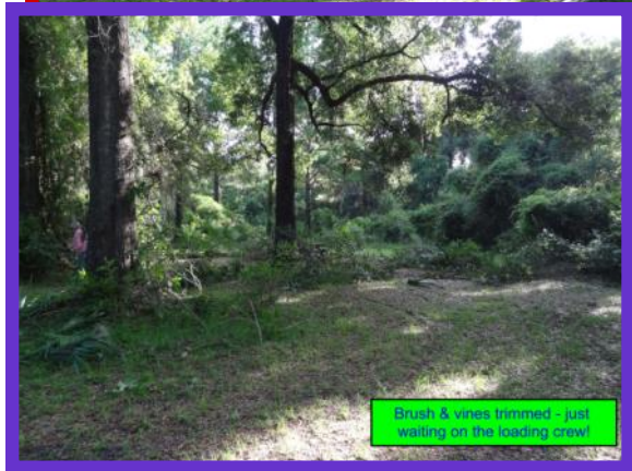
Brush & vines trimmed - just waiting on the loading crew!