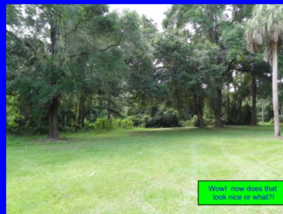
Wow! now does that look nice or what?!