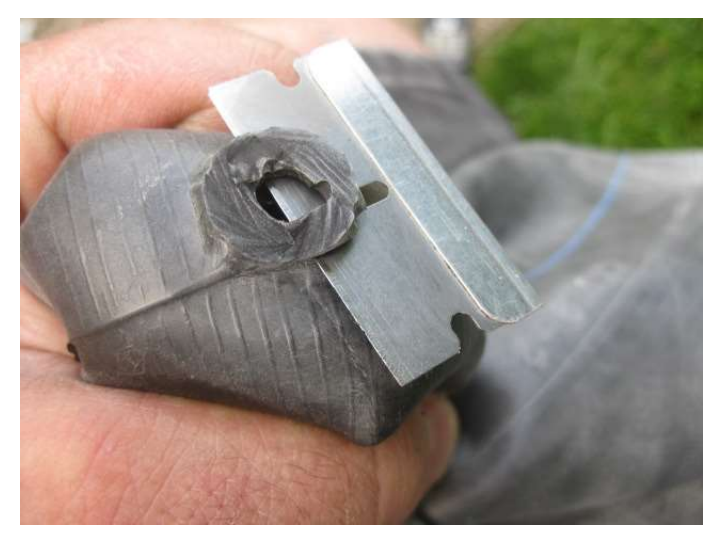
9. Trim close to the base. These multiple extra cutting steps are not necessary if the brass tube was easy to remove and don't want to tear up the tube