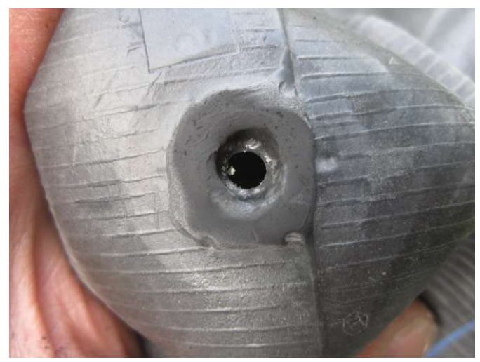
12. The final result after filing it smooth