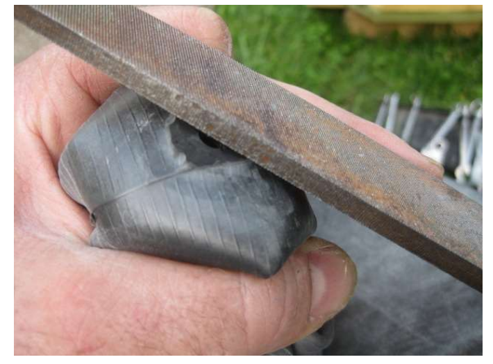
11. Use a flat file to smooth out the cut