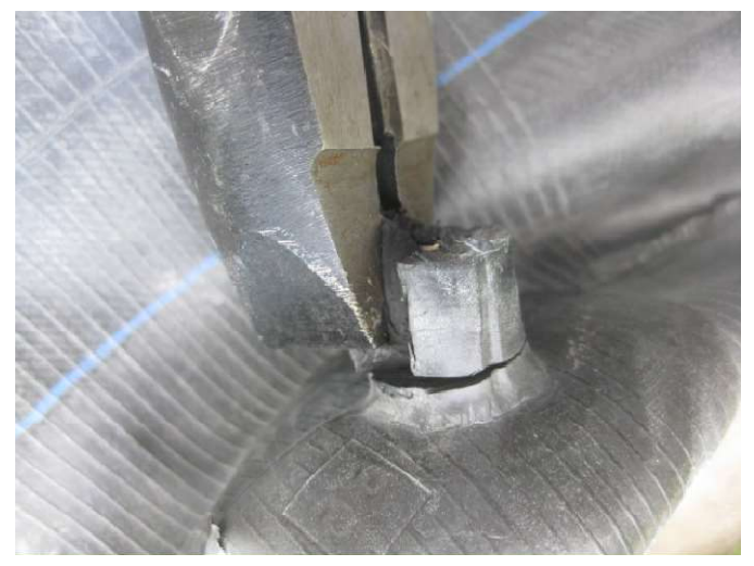
4. Cut away the rubber