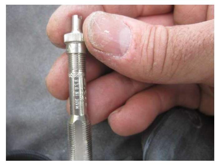
20. Place cap on stem