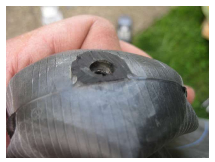
10. Try to end up with something reasonably flat and close to the surface of the tube