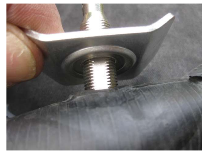
17. Put on the bridge washer. The ridges in the stem base and the bridge washer are enough to seal the air from leaking. You might can use bead sealer if you have some handy