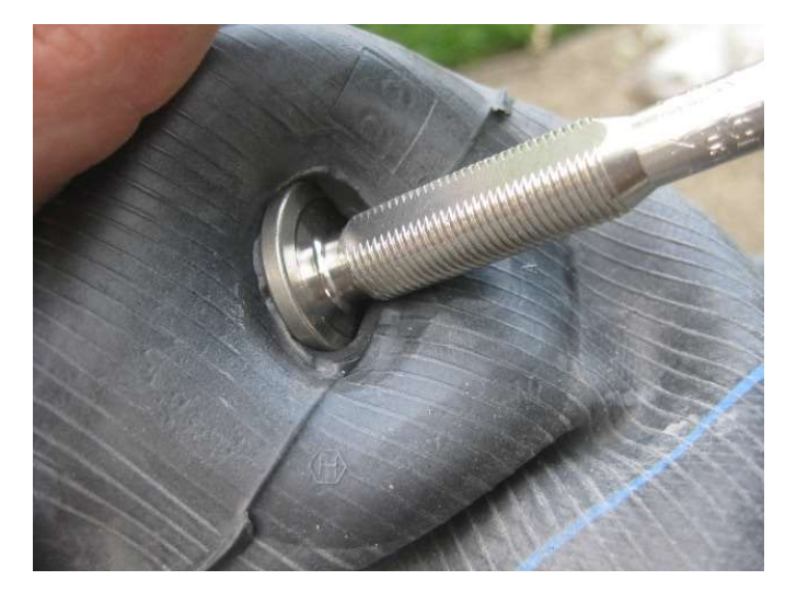
16. Once the stem is in the hole the pliers can be removed to finish inserting the stem