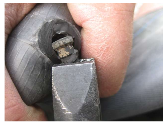
6. Twist the brass tube out. Cut around the edge if needed (see next step below), but the goal is to leave the inside of the hole as round and smooth as possible