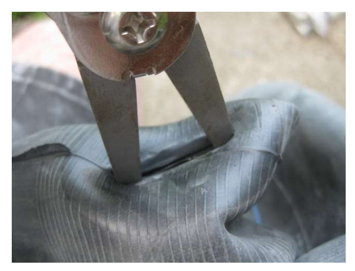
14. Don't be afraid to stretch it open