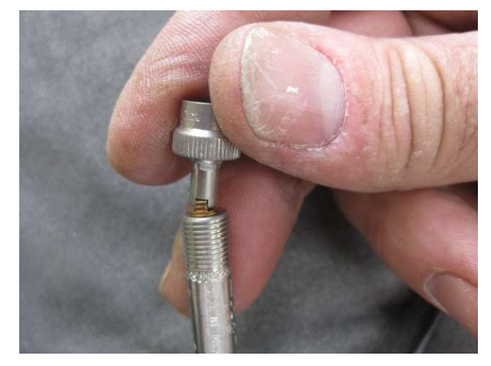
19. Put in a new Schrader valve (particularly if using old stems), and tighten the valve with the cap