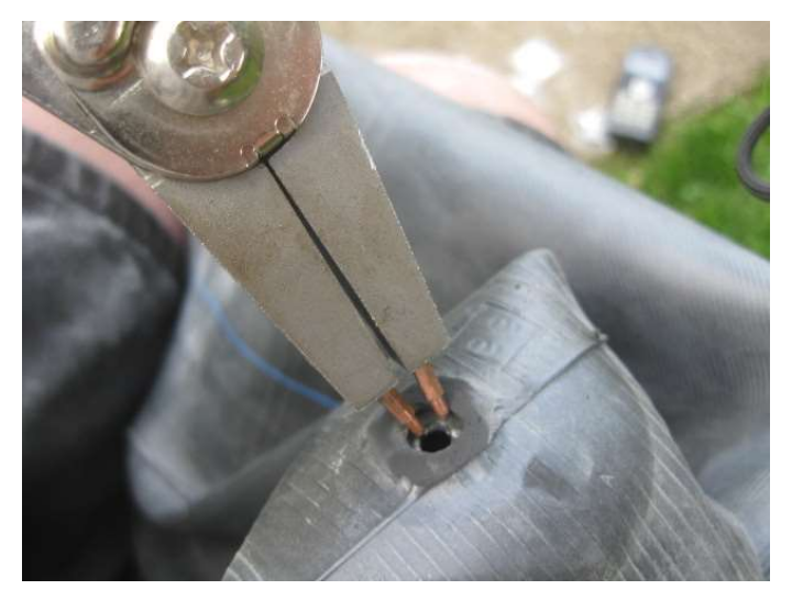
13. Use snap ring pliers or just needle nose pliers to open up the hole