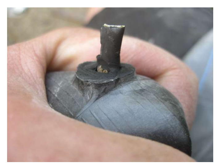
5. The brass tube is now left