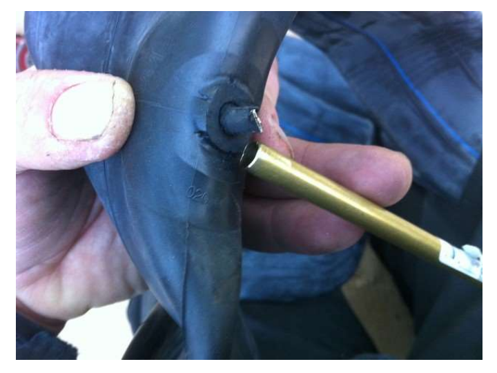
7. If the brass stem is not easy to remove, it will be necessary to cut it out so that the tube doesn't tear and ruin. With a razor blade it is hard to keep it round and this leaves places where it can tear. However, you can use some 5/16" brass tubing to cut around the stem