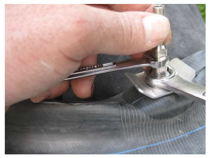
18. Place and tighten down the nut. I've heard some people express concern about making it too tight and squeezing out the rubber from between the washer and the base but I don't see that happening when I get it good and tight by hand. Make sure the stem and washer stay in line with the tube and don't turn as you tighten