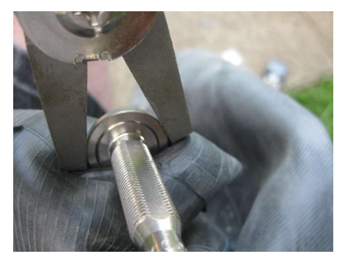
15. These pliers open it up just enough to get the stem started in the hole