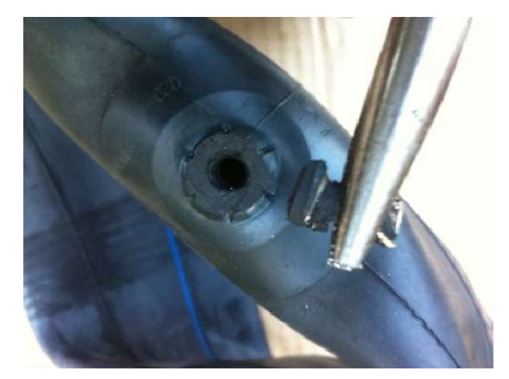
8. Notice how smoothly the cut is around the stem this will help keep it from tearing when the new metal stem is installed and later when the tube is inflated