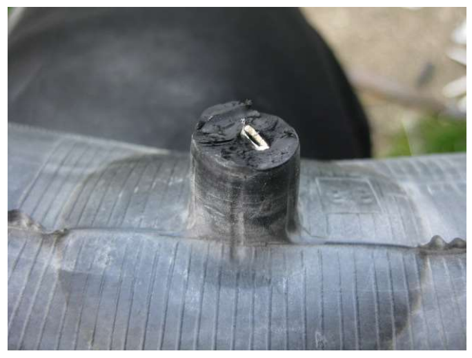
2. This leaves a stub with the (now crushed) brass tube in the center