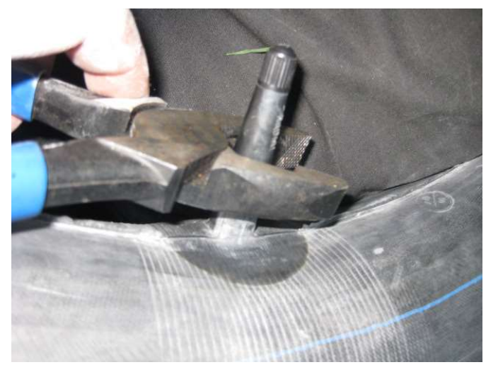
1. Cut off the stem about \frac{1}{4} " from the bottom

Note that these steps are for a tube that has a difficult to remove brass inner stem. Other tubes can be cut off almost flush with the bottom of the valve stem and then the brass part of the stem will easily twist out. When you try the first tube you will find out how easily (or not) the brass stem can be removed. If the brass stem is not easy to twist out (which you hope would be the case with a good tube), it will be necessary to cut around it before twisting it out. A good way to do this is with some brass tubing. Hopefully this will all be clear when looking at the pictures.