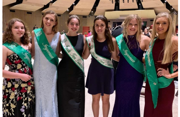
Top Right, Above and at Right: Scenes from 2019 Fiesta Events.

We enjoyed your entries in our “Virtual Fiesta Flower Show” on our Facebook page last month. ¡Viva Fiesta! If you have not “liked” our Facebook page, now is the time to do so @Thewomansclubofsa.