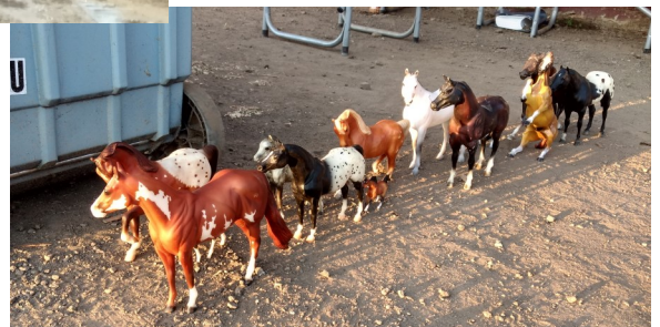
A "stampede" outside one stall

This is how we roll! A nice compact surface for driving!