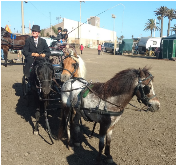
The cutest unicorn hitch!!